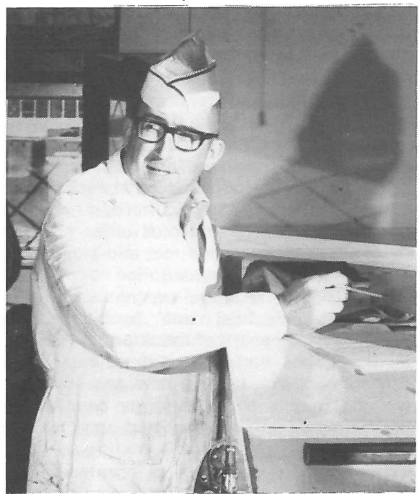
Judging the carcass contest for the Routt County Fair.

home ec. and so on. We try to do it as a community service from people to people. The only thing that we charge for is the rodeo and the barbecue. The barbecue on sale night is kind of a break-even thing for the 4-H kids. They put that on to attract more buyers to the sale.