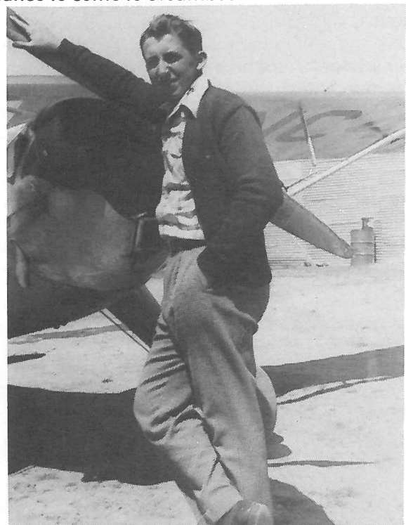
First solo flight - 1946 Luscombe 8-A

"We were there until 1967 and my supervisors said, 'Hey, you need to do more graduate work.' The university has a sort of nice way of putting pressure on. They said, 'We have an opening for a sheep and wool specialist at CSU. You've done your share of work with sheep in the San Miguel Basin, so why not come to Fort Collins?' We had a terrific selection program we put together there. We would use shearing records as a means of selection. We actually graded the fleeces on thousands of head of sheep each spring. We got the fleece data at shearing time in the spring. We then used that selection criteria on the sheep when we went through the herds in the fall. We used individual ear tags and we used portable livestock scales. We weighed a lot of cattle and used that as selection criteria. Needless to say, I went to CSU as sheep specialist for three years. I also did more graduate work and then got the chance to come to Steamboat.