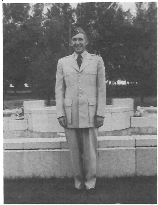
"I got out of college and went into the Air Force in 1952."

navigator training because I found that even though I was the highest in the class of 1952 on pilot aptitude scores, I was nearsighted. I couldn't pass the physical as far as being able to be a pilot. I ultimately ended up in a B-36 squadron which was a great, huge airplane, with 10 engines. Four jets on the wings and six pusher-props.