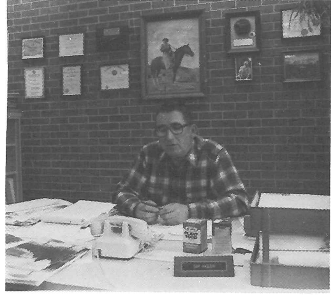
"In the spring you could almost plow the Green River, it was that thick."

"When I went to college I was on what was going to be a six-year program. I would go two quarters and then come home spring quarter and help out on the ranch. I did that for a number of years and then the last year I was in college I just borrowed the money to finish. I took 23 hours a quarter. I made the best grades I ever did that senior year. I got out of college in 1952 and then I went into the Air Force. I went through