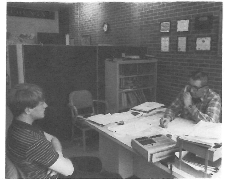
"Every day is different, and is a new challenge."

spend a lot of time behind the wheel of a motor vehicle. Sometimes there are meetings in Fort Collins or Denver. My wife says that I don't spend much time at home and I can believe that. I don't punch a timecard. I work an awful lot of Saturdays, an awful lot of late nights, early mornings and weekends.