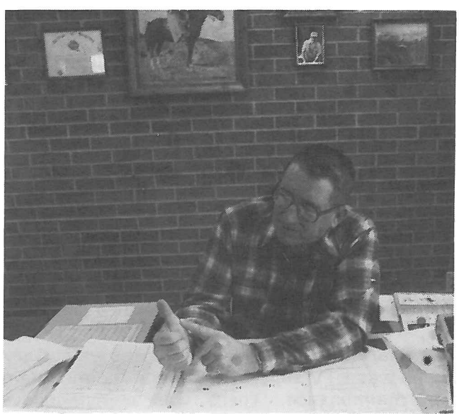
"I flew some 55 air ambulance cases out of that valley."

"There were several reasons why I wanted to come to Routt County. One, I wanted to come here a long time ago, and two is that I loved the freedom of field work rather than campus work a lot more. And so I came here to Steamboat in the summer of 1970. It was 140 or 150 miles closer to the ranch than Fort Collins was, and that was