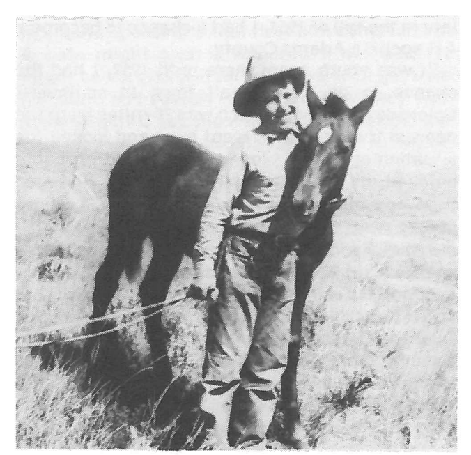
"We didn't have a car or a tractor. We were what some people called poor."

"The house at Jensen had a dirt roof. The ceiling was covered with a piece of cloth very much like percale and we called it a lining. Mom would take it down twice a year, wash it by hand, starch it, iron it and stretch it back up in place with carpet tacks. The walls of the house were made of logs. To recalsamine the walls and to redo the ceiling was a spring and fall chore.