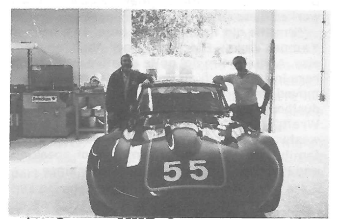
'63 Jaguar XKE Coupe 3.8 straight 6