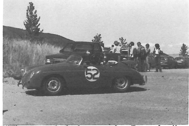
"This year's lady raced a Porsche."

right up on top of it, and summertime is the main time of the year that we need economic help, and they saw the benefit of the race, jumped right on it, and said, 'Go!'