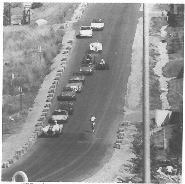
"We had 76 cars in the race.

I asked Ed how they decided the track that was used. "When we chose the track, we did have some other choices. We looked at using the old track, the motorcycle track, which is around Mt. Werner Circle, and that is a 1.1 mile course. Track and safety-wise, it was a little bit better, but interest-wise it just wasn't there. As a matter of fact, when we did the motorcycle race, the vintage bikes that came in (we had vintage bikes coming in from British Columbia, Canada, New