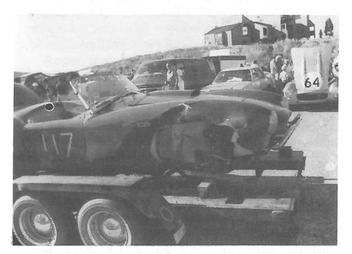
"$5,000 damage right there in the rocks"

"The age range of the drivers is a hard one to say. I would say late 20s on up; they won't tell. I would say mid 50s. There was only one lady driving, I'm sorry to say. I think that that will change; I think that we'll see a lot more women. Motor sports haven't drawn as many women as I think it should. I would like to see more. I've raced motorcycles, and I've raced with women, and they have the ability to see a line better than a man, believe it or not. I'd like to see them in all sports and I think that time will come. In the first race, they had a whole race just for women; I don't like the idea of a powder puff race. I don't think that's right. I want a full blown race; I want the women to get into the cars and go like Guthrie who raced at Indianapolis. This year's lady races a Porsche. Her husband turns the nuts and bolts and she races.